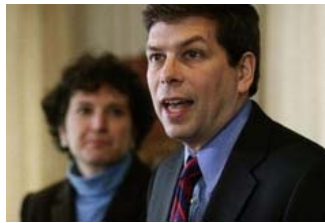
enlarge Sen.-elect Mark Begich

Published: January 3rd, 2009 10:44 PM Last Modified: January 3rd, 2009 10:44 PM