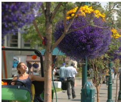
Baskets of lobelia and marigolds line 4th Avenue downtown.