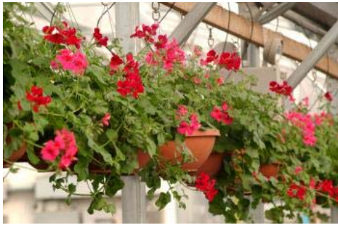
Hanging baskets of ivy geraniums.

Check out the online map for basket locations to choose from. Then fill out the online application form .