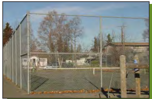
The tennis court surface is cracked and unusable