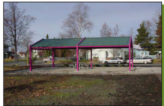
The picnic shelters need repainting and more tables

For a complete directory of Report Card results for neighborhood parks, go to www.AnchorageParkFoundation.org/projects/reportcard.htm